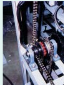
FOUR-WAY SEALING MACHINE