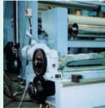
PAPER MAKING MACHINE UNWINDER