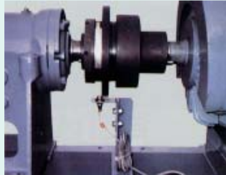
HIGH VISCOSITY PUMP