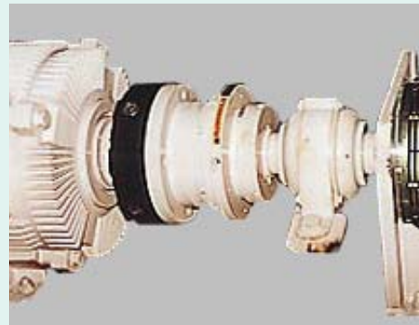
MATERIAL HANDLING MACHINE